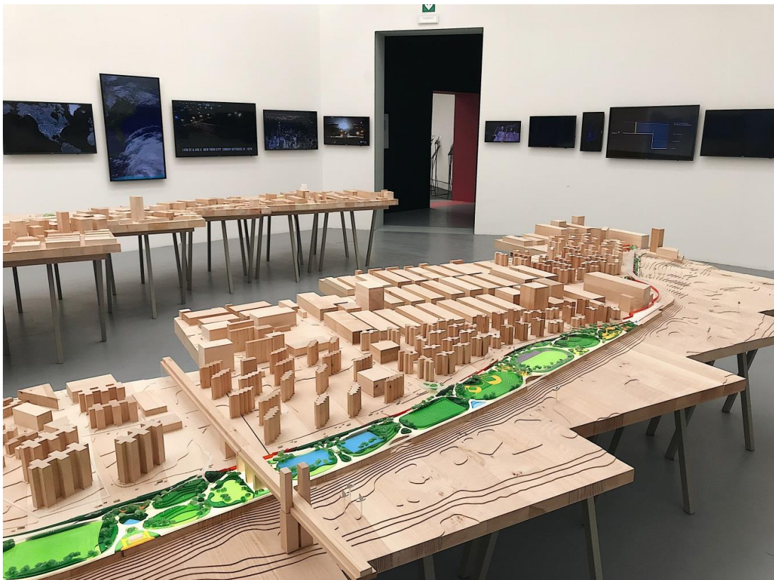
Pic 02. BIG U model at The 16 th Architecture Biennale in Venice