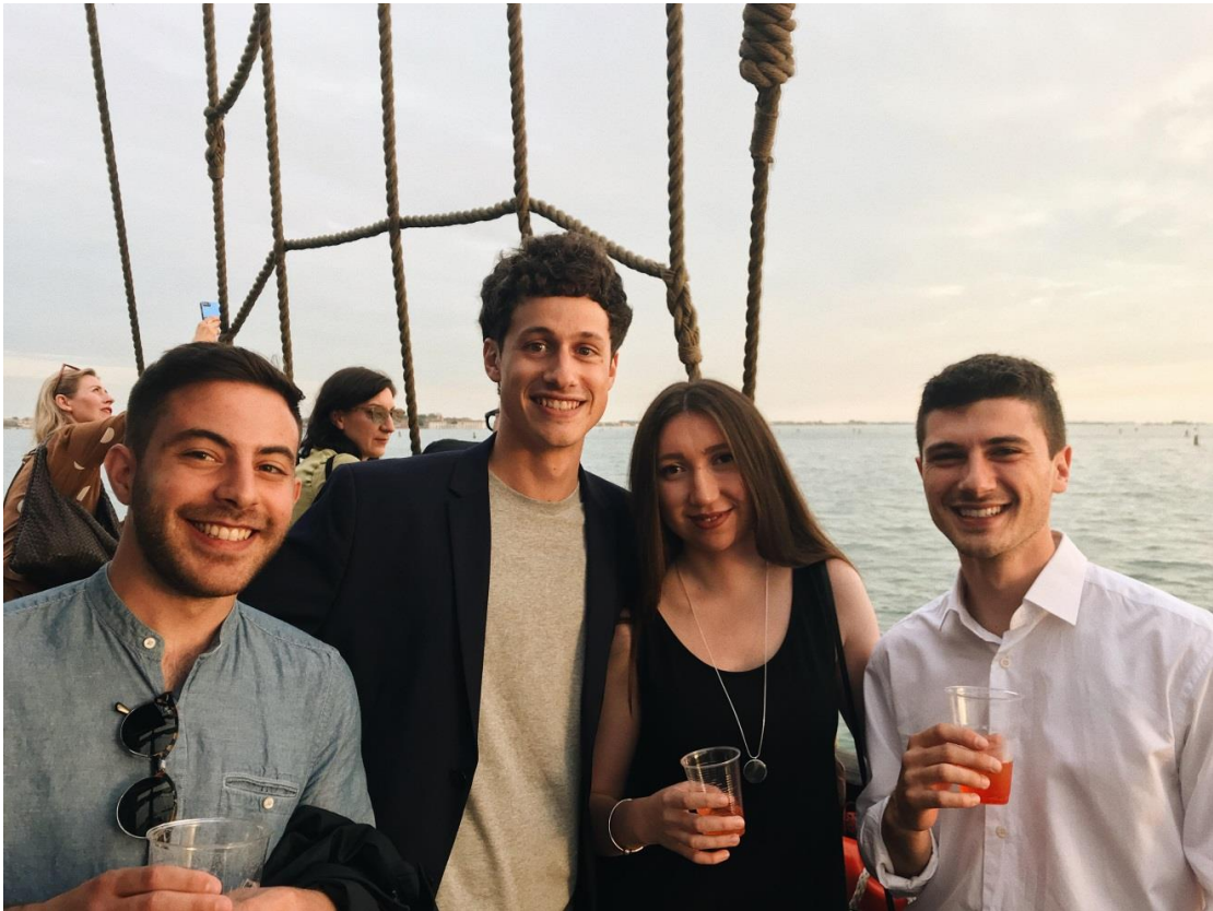
Pic 03. BIG boat party in Venice