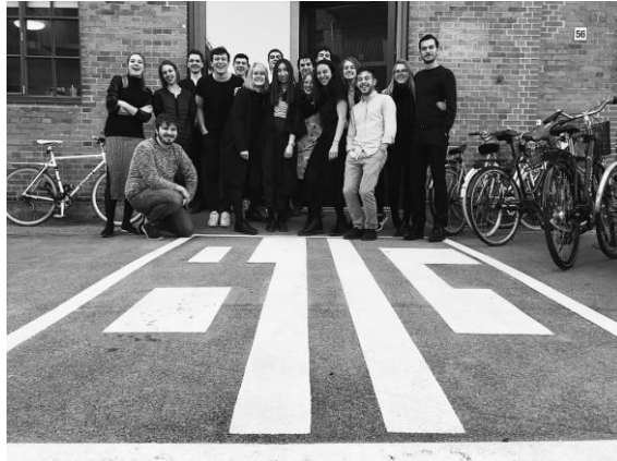
Pic 04. Office spaces